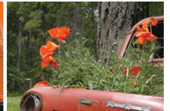
Above, from left: Saturday market blown glass and a Gabriola Island flower planter — two examples of island life.